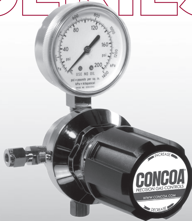
205 3021-000 shown