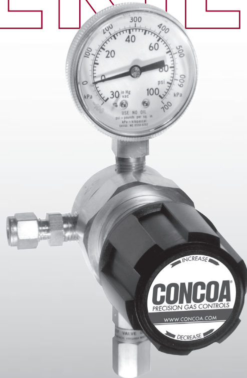
425 2021-000 shown