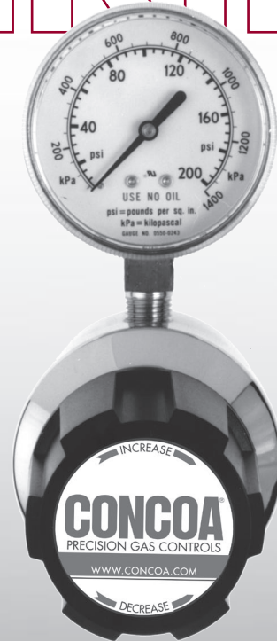
483 3001-000 shown