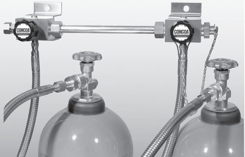
52B 1232-580 shown

The 52B, 52C and 52S Series Maniflex are modular gas distribution systems that may be connected to regulators, dual regulator switchovers, IntelliSwitch and AutoSwitch systems. A modular gas distribution system allows the user to size the inlet capacity of a system so that cylinder changes will not be as frequent. The Maniflex system provides the user with the capability of purchasing an unlimited number of manifold stations connected to a single header. The Maniflex headers themselves may be purchased as a complete system (unassembled) or as individual components.