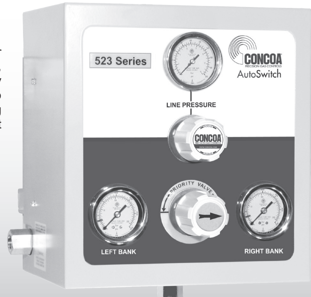
523 300A shown

The 522 Series AutoSwitch is a continuous gas delivery system for high purity gas service, typically in the laboratory or process plant, that automatically changes cylinder or bank priority from the primary source to a reserve supply without transmitting pressure fluctuations to the use line. Options include internal pressure switches with warning lights for cylinder depletion or internal pressure transducers without warning lights. Both may be used with an Altos alarm.