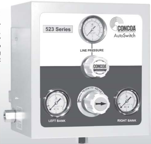
523 300A shown

The 523 Series AutoSwitch is a continuous gas delivery system for high purity gas service, typically in the laboratory or process plant, that automatically changes cylinder or bank priority from the primary source to a reserve supply without transmitting pressure fluctuations to the use line. Options include internal pressure switches with warning lights for cylinder depletion or internal pressure transducers without warning lights. Both may be used with an Altos alarm.