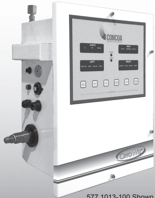
577 1013-100 Shown