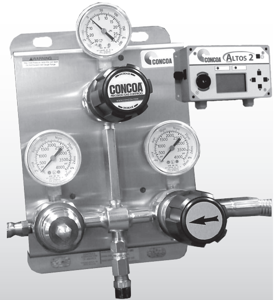
526 411G shown with attached flexible hoses. Available with optional remote alarm.