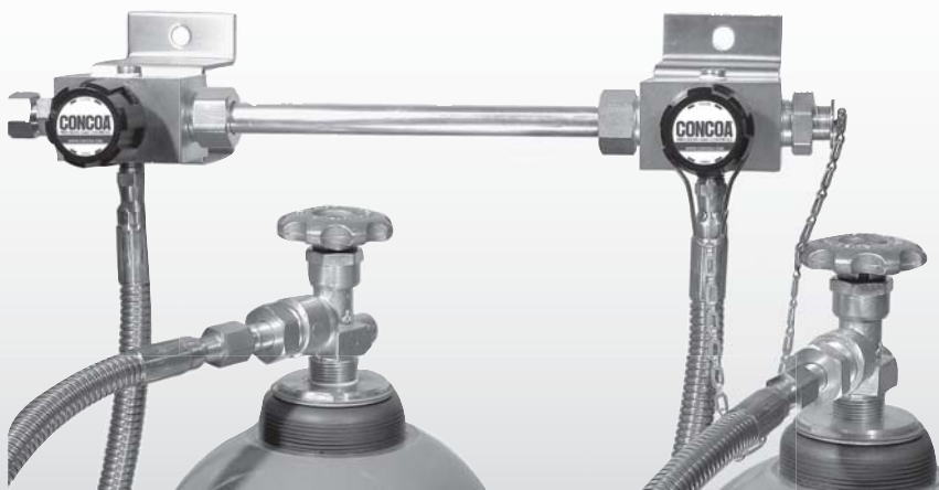
52B 1232- shown