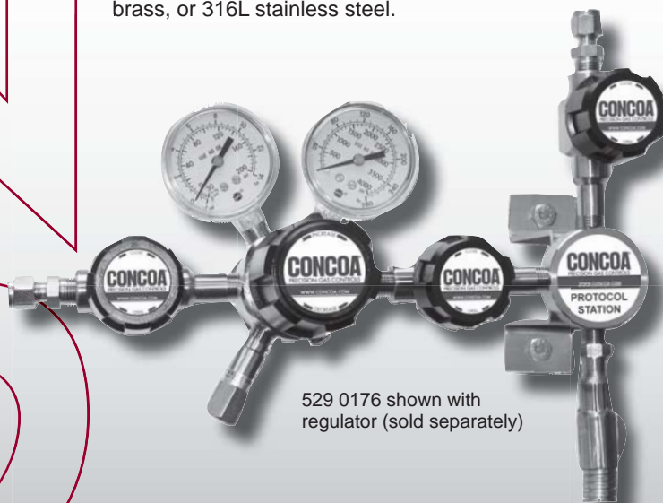
529 0176 shown with regulator (sold separately)

The 529 Series Protocol Purge Station combines all the safety and convenience of a standard Protocol Station with a feature to purge the hose and inlet side of the regulator. The Protocol Purge Station allows isolation of the regulator inlet and is equipped with a purge valve at the 12 o'clock position on the mounting block with a 1/4" stainless steel Tube fitting to safely pipe away the process gas during purging, if required. This station comes complete with mounting block and bracket, two 533 Series diaphragm valves and 3-foot all stainless steel hoses with armor casing. Available in brass, chrome-plated brass, or 316L stainless steel.