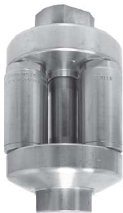
CONCOA MAXFLOW 801-7015