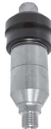
CONCOA AUTOSTOP 801-7001

Flashback Arrestors can be easily installed on the outlet fitting of most regulators, gas supply points or inline. They help meet ANSI Z49.1:2005, OSHA, and NFPA safety requirements and help protect against the most common causes of accidents such as reverse flow, flashback, and hose burn backs. Each CONCOA flashback arrestor is 100% tested with actual flashbacks and have built in 100 micron inlet filters, reverse flow check valves (non-return valves), flame barriers, and thermal cut off valves.