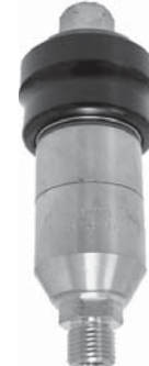
CONCOA AUTOSTOP 801-7001

Flashback Arrestors can be easily installed on the outlet fitting of most regulators, gas supply points, or inline. They help meet ANSI Z49.1:2005, OSHA, and NFPA safety requirements and help protect against the most common causes of accidents such as reverse flow, flashback, and hose burn backs. Each CONCOA flashback arrestor is 100% tested with actual flashbacks and have built in 100 micron inlet filters, reverse flow check valves (non-return valves), flame barriers, and thermal cut off valves.