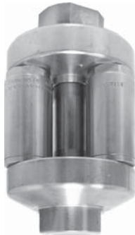
CONCOA MAXFLOW 801-7015