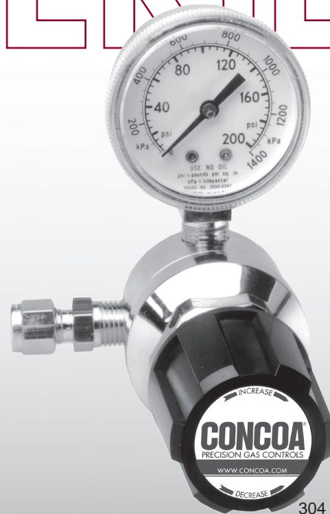
304 3021-000 shown

Bulk gas distribution systems Gas and liquid chromatography High purity carrier gases Zero, span, and calibration gases Liquefied hydrocarbon gas control Control of cryogenic gases