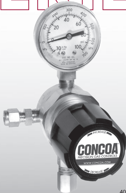
405 2021-000 shown