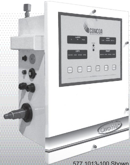
577 1013-100 Shown