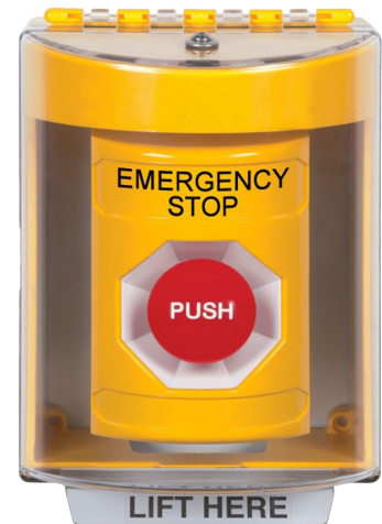
585 2001 shown