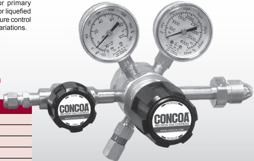
411 2331-580 shown