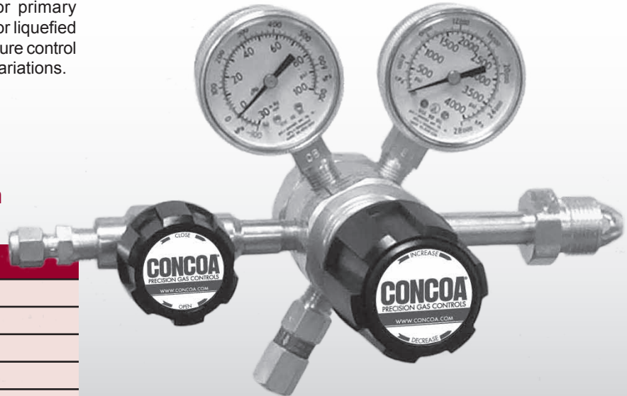
412 2331-580 shown