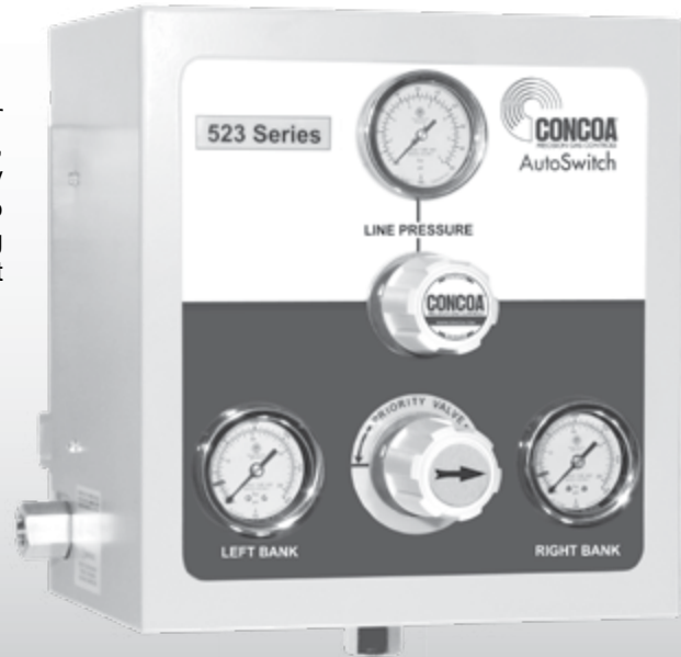
523 300A shown

The 522 Series AutoSwitch is a continuous gas delivery system for high purity gas service, typically in the laboratory or process plant, that automatically changes cylinder or bank priority from the primary source to a reserve supply without transmitting pressure fluctuations to the use line. Options include internal pressure switches with warning lights for cylinder depletion or internal pressure transducers without warning lights. Both may be used with an Altos alarm.