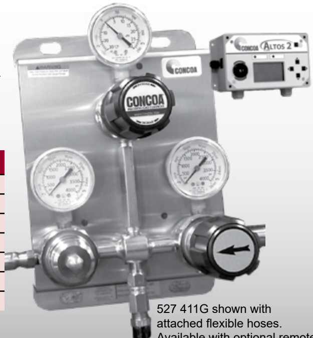
527 411G shown with attached flexible hoses. Available with optional remote alarm.