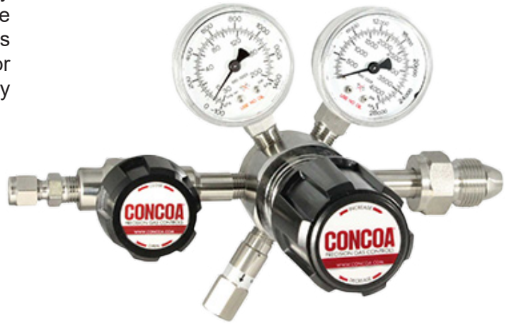
422 3331-01-580 shown