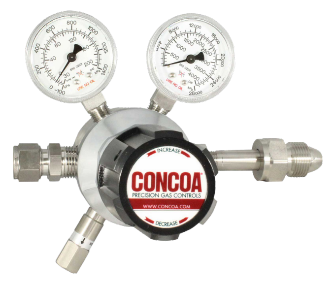
486 33P1-01-580 shown