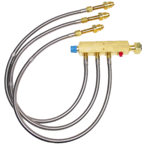
52L 1053-580 shown

The 52L Series Vent MicroManifold offers a compact and reliable solution for safely venting residual gas pressure from cryogenic liquid cylinders in multi-cylinder lab installations. Configured as a vent manifold, the 52L equalizes headspace pressure across connected liquid cylinders, enabling equal withdrawal and maximizing flow capacity with minimal product loss. By venting vaporized gas from the liquid supply source, it prevents cross-contamination, protects downstream equipment, and ensures proper line de-pressurization. The 52L Series MicroManifold can also be configured as a gas micromanifold for systems using high pressure gas cylinders, offering flexibility across various gas delivery installations.