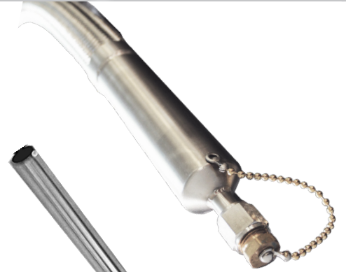
5512000 inlet with plug and chain shown

The 551 Series Vacuum-Jacketed Hose is a sturdy cryogenic transfer line designed to work with the 577 CryoWiz™ cryogenic switchover system and 57V Series cryogenic header to provide a complete cryogenic solution for continuous liquid nitrogen supply. Because liquid nitrogen has an extremely low boiling point, an increase in temperature can cause it to boil off and evaporate quickly. The combination of vacuum-jacket and insulation reduces heat transfer and helps maintain the low temperature of the cryogen. CONCOA offers the 551 Series semi-flexible vacuum-jacketed hose with a braided outer jacket for connection from the primary liquid cylinder source to the CryoWiz™ cryogenic switchover system. For connection from the CryoWiz™ to application distribution, the 551 Series ultra-flexible vacuum-jacketed hose, with an unbraided inner core for added flexibility, provides optimal transfer functionality for point-of-use applications. CONCOA 551 Series VJ hoses are available in longer lengths based on customer specifications and specific needs.