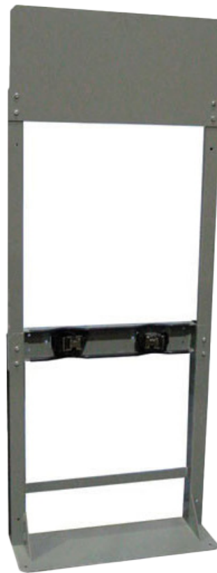
518 1625 shown