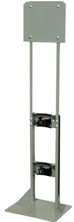
518 1610 shown